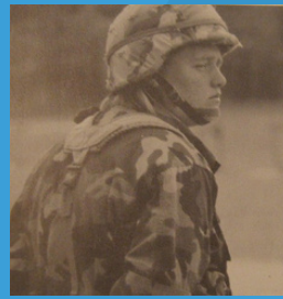
BOOK TITLE: FOUR YEAR HEAD START; SURVIVING THE ARMY AND ACHIEVING MY DREAMS

I SOMETIMES FELT THAT BEING IN THE ARMY HAD PUT ME BEHIND EVERYONE ELSE. AT THE END OF MY FOUR YEAR ENLISTMENT, MOST OF MY HIGH SCHOOL CLASSMATES WERE GRADUATING COLLEGE AND GETTING MARRIED WHEREAS I WAS JUST GETTING STARTED AT LIFE. I EVENTUALLY REALIZED THAT MY TIME IN THE ARMY HAD GIVEN ME A HUGE ADVANTAGE WHEN IT CAME TO AFFORDING COLLEGE AND HAVING HEALTHCARE IN THE CIVILIAN WORLD. THE ARMY HAD A VERY PROFOUND IMPACT ON ME IN BOTH POSITIVE AND NEGATIVE WAYS. NAVIGATING IT AS A FEMALE, AND ONE WHO WAS NOT NATURALLY THIN AND ATHLETIC WAS CHALLENGING, BUT I ALSO GAINED A LOT. TWO SIGNIFICANT EVENTS THAT OCCURRED DURING MY ENLISTMENT WERE THE DON'T ASK, DON'T TELL POLICY, WHICH HELPED SHAPED ME AS AN ALLY TO LGBTQ+, AND 9/11, WHICH HAPPENED HALFWAY THROUGH MY ENLISTMENT. WHEN I GOT OUT, I SPENT 3 MONTHS TRAVELING THE WORLD WITH SEMESTER AT SEA. IT WAS THE MOST INCREDIBLE EXPERIENCE, AND ALLOWED ME TO SEE AND EXPERIENCE SO MANY WILDLY DIFFERENT THINGS THAN WHAT MY WORLD HAD BEEN THE 4 YEARS PRIOR. IT WAS THE BEGINNING OF FINDING MYSELF AND BREAKING FREE.