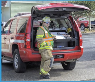
BOOK TITLE: PROTECTING NEWPORT FROM EMERGENCIES AND DISASTERS SINCE 2003

I HAVE SERVED THE NEWPORT COMMUNITY FOR 20 YEARS IN VARIOUS ROLES IN FIRE AND EMS. FROM BEING A FIREFIGHTER AND A PARAMEDIC THEN MOVING TO TRAINING OFFICER. I TAUGHT NEW FIREFIGHTERS. I HAVE BEEN THE FIRE MARSHAL, INVESTIGATING FIRES AND CONDUCTING FIRE INSPECTIONS. FOR THE LAST 9 YEARS I HAVE BEEN FIRE CHIEF. I HAVE BEEN IN COMMAND ON SOME OF THE LARGEST INCIDENTS IN RECENT HISTORY. THE CITY CENTER HOTEL FIRE, A LARGE AMMONIA LEAK ON THE BAY FRONT AND THE LANDSLIDE ON NE 70TH DRIVE THAT TOOK OUT 3 HOMES IN 2015. I COORDINATED THE CITY'S RESPONSE TO THE COVID-19 PANDEMIC. I HAVE BEEN INVOLVED IN EMERGENCY MANAGEMENT AND PLANNING WITH THE CITY FOR OVER 15 YEARS.